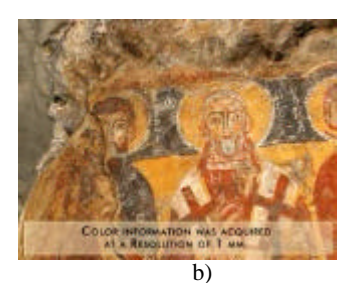
Fig. 5. Movie: a) view of crypt without texture, b) view of main pillar with texture.

A number of models with different levels of complexity were created from the original data. At the highest quality, the spatial resolution on the wall is about 5 mm