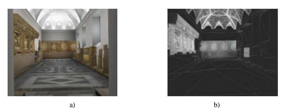
Fig. 8. Museum room, a) Rendering of the complete 3D model of the museum room, b) wiremesh showing the multi-resolution model.