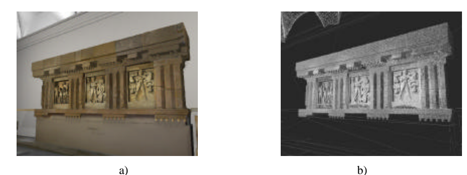
a) b) Fig. 7. Three-dimensional model of Frieze of Temple C, a) texture-mapped 3D model, b) wiremesh of 3D model showing the levels of details.