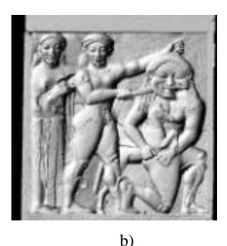
Fig. 6. Model of the Metope "Perseo and Medusa", a) texture-mapped 3D model, b) shaded view of the same 3D model.