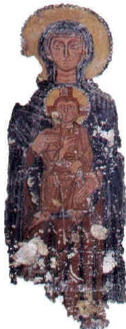
A fresco of Santa Cristina Crypt of Carpignano (LE)

The 3D Byzantine provides digital acquisition and construction of three-dimensional models of structures and environments of subterranean and sub divo Byzantine churches of the Salento Peninsula. 3D Byzantine includes, therefore, the databases 3D Crypts and the 3D Subdivo , mainly inspired by the Santa Cristina Crypt of Carpignano (LE) and from the San Pietro Church of Otranto (LE).