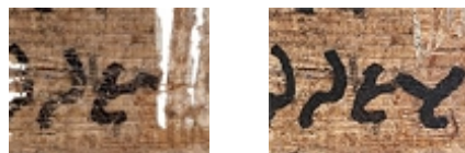
Detail of a fragment of a Greek papyrus, of the Ptolemaic period (III/II b.C.) before and after the virtual restoration.

The archives of papyrus material already realized contain, besides the descriptive records, the images of Greek and Demotic papyri, both in a high resolution TIFF format (6000x7000 pixels) allowing in-depth studies and a virtual restoration by the experts, and in a low resolution JPEG format (550x850 pixels), for on-line consultation by the community of users.