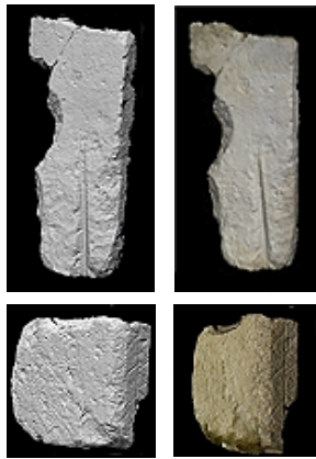
Two three-dimensional models of stelae, one with and one without texture

Therefore the creation of several databases, as for instance the 3D stelae and cippus database and others, concerning in particular the archaeological excavations of Cavallino (LE), is expected.